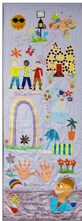
Spirit of Optimism And Openness