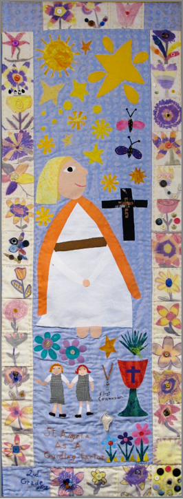
The Christ-Centered Spirit Of Saint Angela Merici As A Guiding Factor In The School

Banners illustrating the nine characteristics of an Ursuline education were designed and produced by St. Ursula Villa students in the Arts Fund and Villa Parents Organization, the beautifully quilted and embellished banners are a visual representation of Ursuline