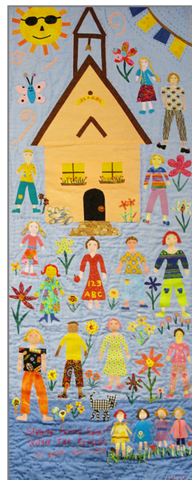
Strong Family Spirit Within The School