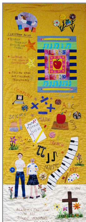
Academic Excellence In All Subjects